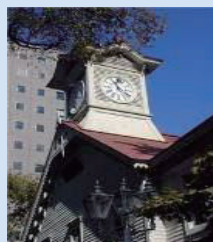
Sapporo City Clock